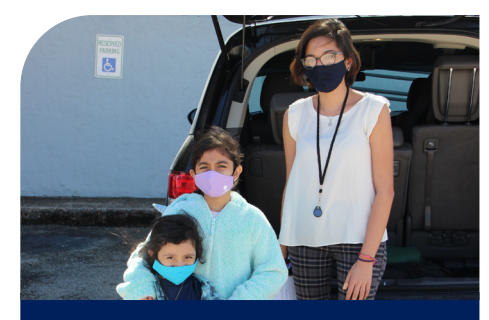
16,892 individuals and families served through our programs and emergency assistance events